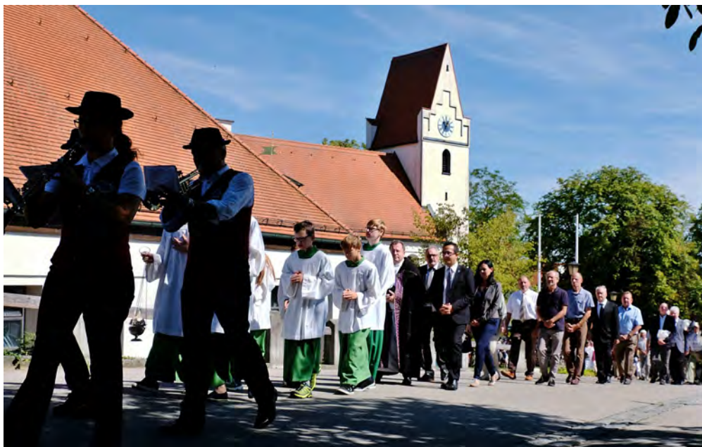
A Marching Band leads the congregation after Mass to the cemetery where the Memorial is situated.