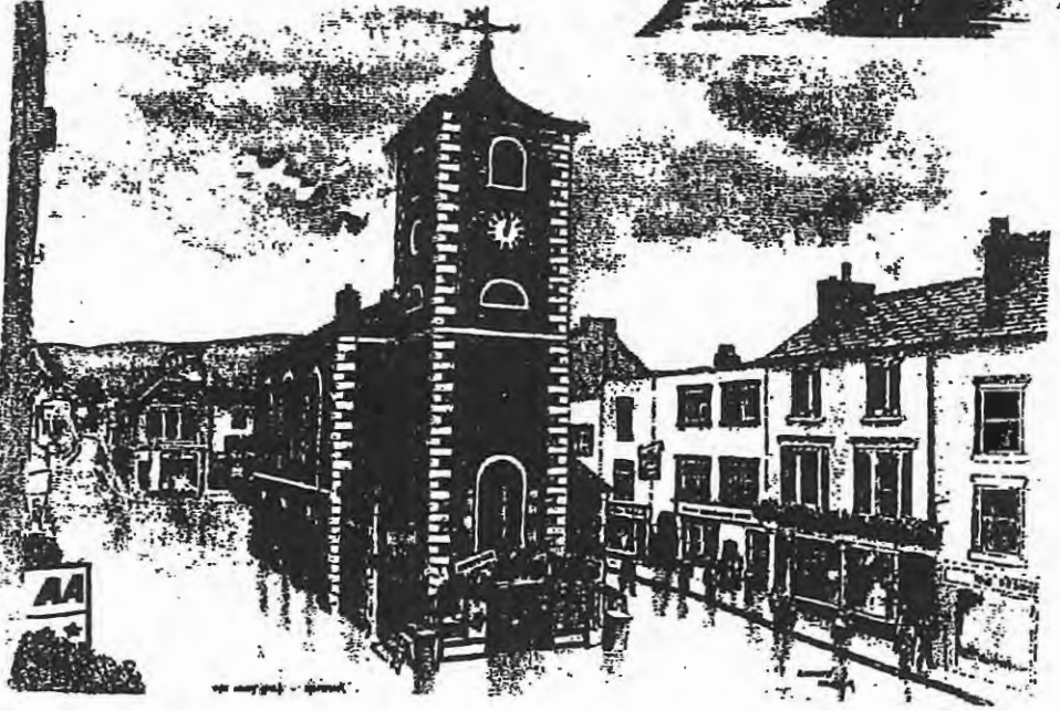
The Moot Hall KESWICK