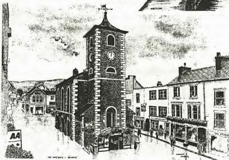
The Moot Hall KESWICK